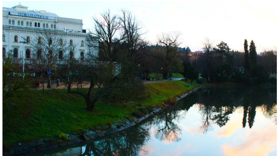
Sunset in Gothenburg, Sweden.

View all photos from the meeting on the SRA Flickr account: https://www.flickr.com/photos/society_for_risk_analysis