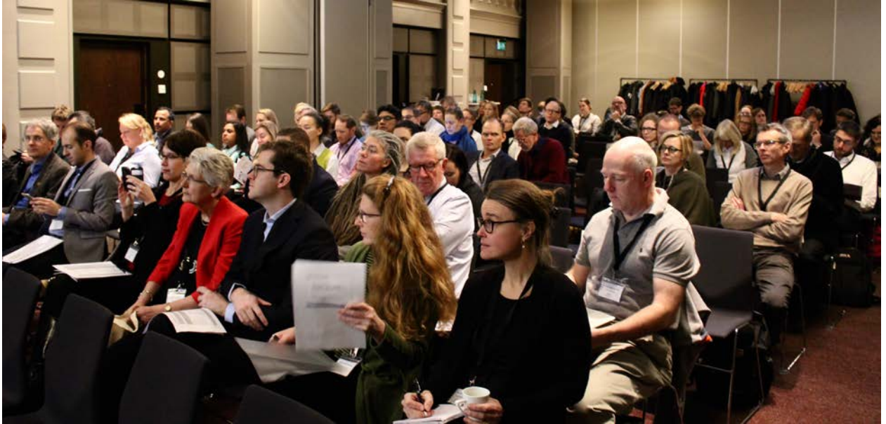
SRA 2016 Nordic Annual Meeting, Gothenburg, Sweden.