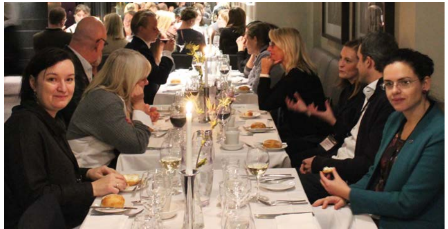
Dinner in the Clarendon Post Hotel.